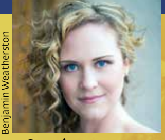
Starring soprano Caitlin Lynch