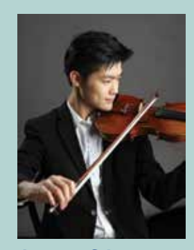
I'm grateful to MOR for opening me up and exposing me to possibilities making music that makes a difference in our society.

It's been such a thrill and honor to have played even a small part in the development of this remarkable artist and young man.